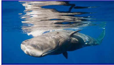
This sperm whale, seen swimming just under the surface of the Caribbean, was photographed last year.

It's the first dead whale that's been found since an oil rig exploded and sank in the Gulf in April, killing 11 workers. The whale wasn't found in oiled water but the location of its death is unknown. NOAA marine mammal experts are working to determine the location from which the whale's body may have drifted.